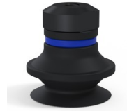
Variant reference: 91 20NI FM5GIC