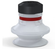
Variant reference: 91 20SLT FM5GIC