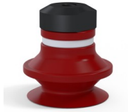
Variant reference: 91 20SL FM5GIC