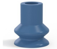
Variant reference: 87A 30SLBLEU A