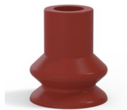
Variant reference: 87A 30SLBRIQUE A