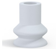
Variant reference: 87A 30SLB A