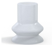
Variant reference: 87A 30SLT A SH50