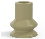
Variant reference: 87A 30CN A