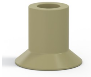
Variant reference: 73A 20CN A