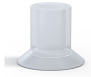
Variant reference: 73A 20SLT A