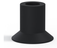
Variant reference: 73A 20NI A