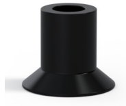
Variant reference: 73A 20PARA A