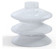
Variant reference: 2 87SLT A