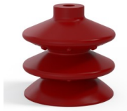
Variant reference: 2 87SL A