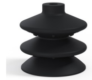
Variant reference: 2 87NI A