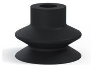
Variant reference: 1 30NI A