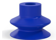
Variant reference: 1 30PU A