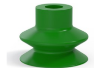
Variant reference: 1 30SLV A