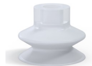
Variant reference: 1 30SLT A